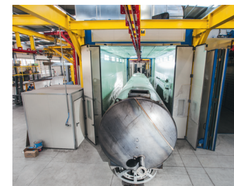
LIQUID PAINTING OF METALS