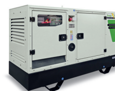
SOUNDPROOF GENERATING SETS