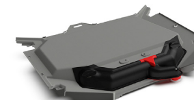
VEHICLE LININGS AND BODIES