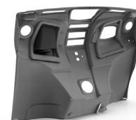
DASHBOARDS FOR INDUSTRIAL VEHICLES