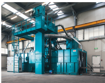
SANDBLASTING OF METALS