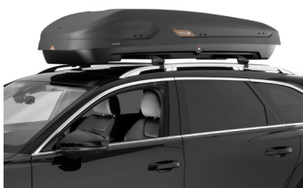
ROOF BARS AND ROOF BOXES