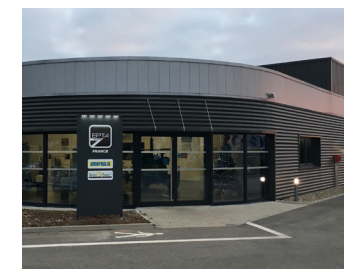
SHOWROOM AND SERVICE CENTRE