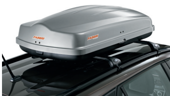
ROOF BARS AND ROOF BOXES