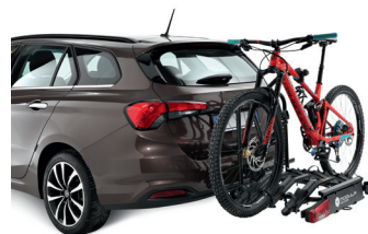
TOWBAR, TAILGATE AND ROOF BIKE CARRIERS