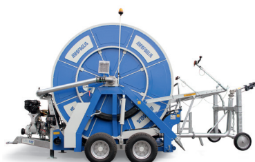
MACHINES AND MOTORPUMPS FOR IRRIGATION