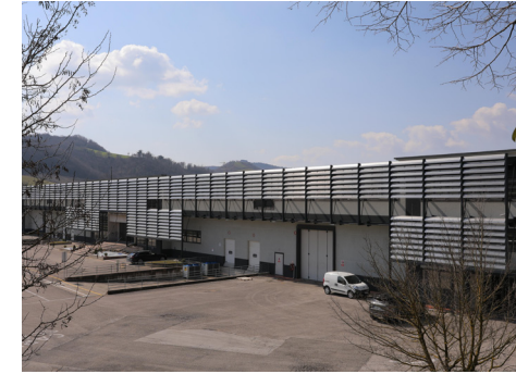
EPTA POLO 3 PIANDIMELETO (PU) ITALY