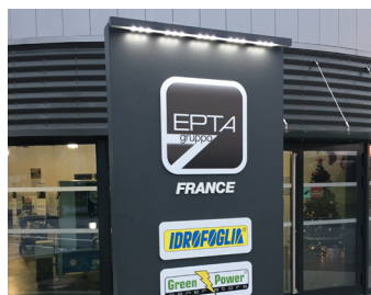
SHOWROOM AND SERVICE CENTRE