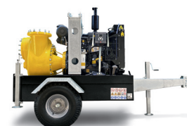
DEWATERING AND INDUSTRY