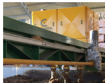
CLF MODIL - MIXING AND OXYGENATION