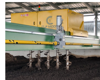
CLF MODIL - MIXING OF THE SOIL IMPROVER AFTER COMPLETION