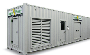
CONTAINER GENERATING SETS