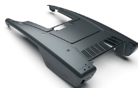
SPECIAL COMPONENTS FOR THE AUTOMOTIVE