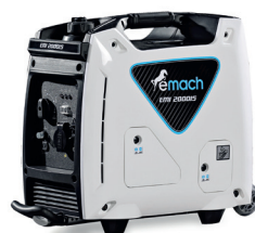
SOUNDPROOF INVERTER GENERATORS