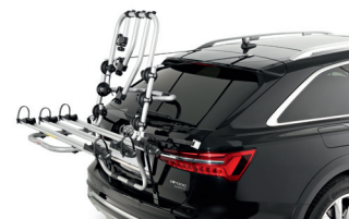
BIKE CARRIERS, SKI RACKS AND CAR ACCESSORIES