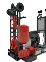
FIRE FIGHTING SYSTEMS