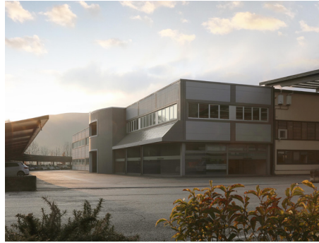
EPTA POLO 2 SASSOCORVARO (PU) ITALY