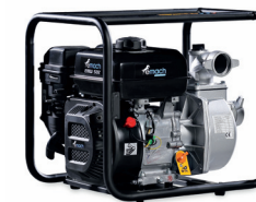
SELF-PRIMING MOTOR PUMPS