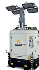
LIGHTING TOWERS WITH BATTERY AND ENGINE