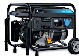
AVR CURRENT GENERATORS