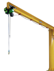
COLUMN-MOUNTED JIB CRANES WITH CANTILEVER ARM