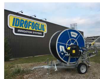
SHOWROOM AND SERVICE CENTRE