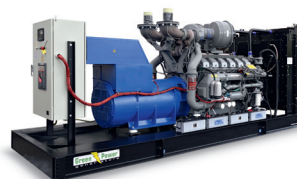
OPEN GENERATING SETS