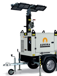
LIGHTING TOWERS WITH ENGINE