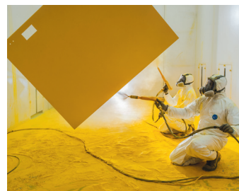
POWDER COATING OF METALS