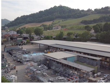
EPTA POLO 1 LUNANO (PU) ITALY