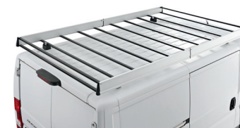
EQUIPMENT FOR COMMERCIAL VEHICLES