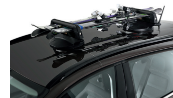
SKI RACKS AND CAR ACCESSORIES