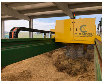
CLF MODIL - WASTE DISTRIBUTION SYSTEM