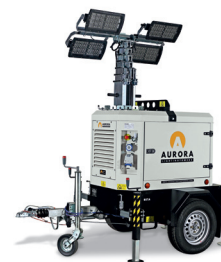
LIGHTING TOWERS WITH ENGINE, BATTERY OR HYBRID