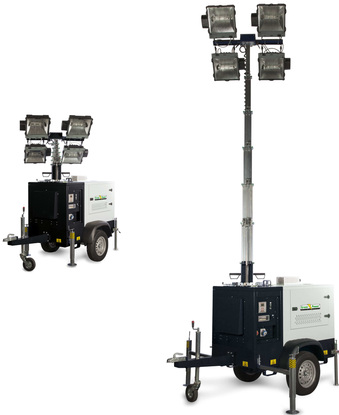
Immagine a scopo illustrativo images are for illustrative purpose only images à but illustratif

Tour d'éclairage à mât vertical et lavage hydraulique.